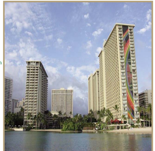
Story & Photo Credit: Wikipedia and Hawaii Visitor's Bureau

An economic and tourism boom following statehood brought rapid economic growth to Honolulu and Hawai'i. Modern air travel would bring thousands, eventually millions (per annum) of visitors to the Islands. Today, Honolulu is a modern city with numerous high-rise buildings, and Waikiki is the center of the tourism industry in Hawai'i, with thousands of hotel rooms.