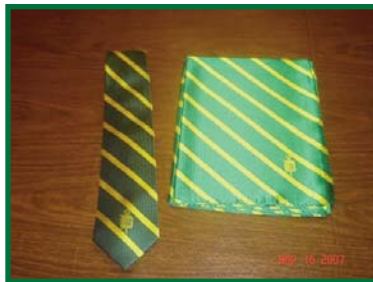
ICD Ties & Scarves