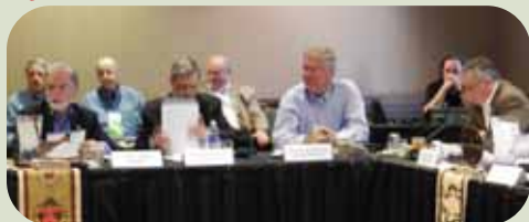
Board of Regents Meeting