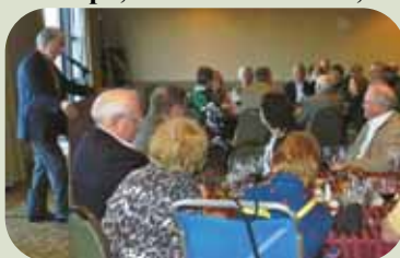
Board of Regents Dinner