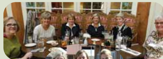
ICD Spouses Enjoy Santa Fe