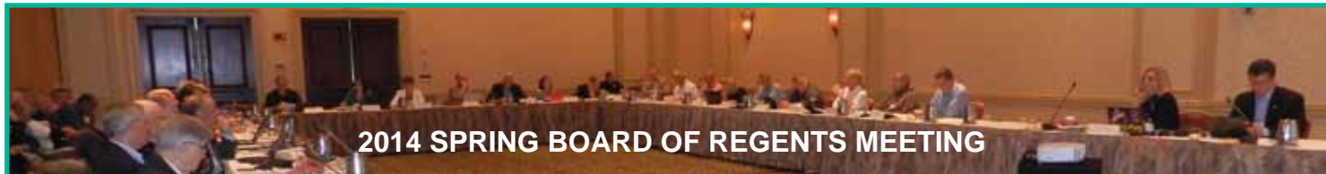
2014 SPRING BOARD OF REGENTS MEETING

2014 Annual Meeting & Convocation October 7-10, 2014 • San Antonio, TX Pages 3-5