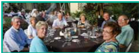
2014 SPRING MEETING Bonita Springs, FL