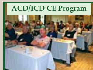
ACD/ICD CE Program