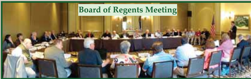
Board of Regents Meeting