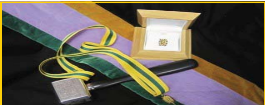
Fellowship Key, President's Pin and Antique Mallet

The College was formed to advance the science and art of dentistry for the health and welfare of the public, to bring together the world's outstanding members of the dental profession for the exchange of dental knowledge, and to encourage the growth of the profession worldwide.