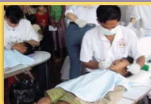
Program activities in Vietnam

The USA Section of the ICD helped fund the original Humanitarian Outreach Project, the Vietnam Project. The project is an international effort which has addressed Vietnam's dental needs through the establishment of a specialty training program in public health dentistry at Odonto-Stomatology in Ho Chi Minh City. The program was so successful that it was expanded into Laos and Cambodia. The Section worked with Health Volunteers Overseas, a private non-profit organization committed to improving health care in developing countries through training and education.