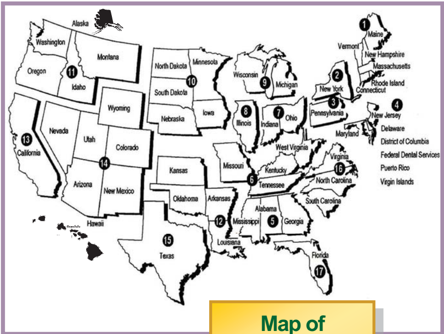
Map of USA Section Districts

The USA Section is subdivided into Districts. There are presently seventeen Districts in the United States corresponding to the seventeen Trustee Districts of the American Dental Association.