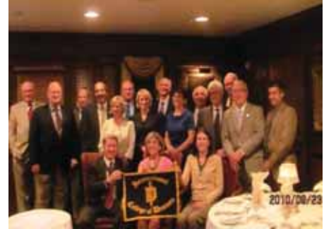
NH Annual Meeting