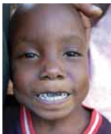
Haitian children awaiting treatment