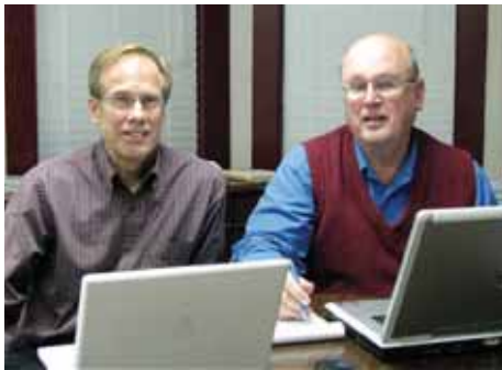
NH Fellows at work