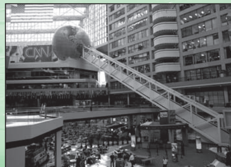
(Above) The CNN Center, Atlanta

Spouses Program - Two of Atlanta's Top Interior Designers have been engaged to prepare a custom presentation for the event. Lectures and visual demonstrations will be supplemented by a visit to two of Atlanta's most interesting homes, followed by a luncheon at one of the most scenic settings in America. There will be a modest fee for this program and reservations must be accepted on a "first come" basis.