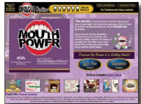
Online, the MouthPower program shares the power of a healthy smile with children across the country through an entertaining and educational web experience developed in partnership with the American Dental Association.

The Dr. Samuel D. Harris National Museum of Dentistry, a recipient of International College of Dentistry support, has been honored with the 2008 Shils Award for being an outstanding transformational leader and demonstrating a commitment to promoting public oral health awareness by developing innovative and entertaining educational programs for children. The Dr. Edward B. Shils Entrepreneurial Education Fund presented the award on June 17, 2008. The Museum was commended for its dedication to connecting the ideas of good oral health and a healthy life through its national and local programs and web site, ensuring that people take an active interest in their personal oral healthcare.