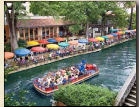
(Above) San Antonio River Walk