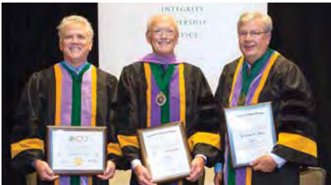
President Citation Recipient and Master Fellows